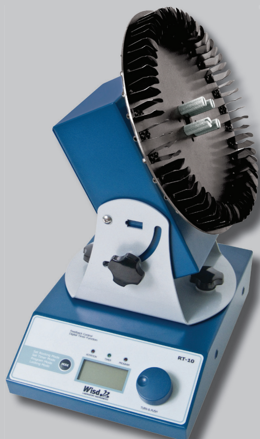
RT-10 with disk WRT120